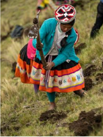
Villaconata, Peru. Credit: Wade Million.